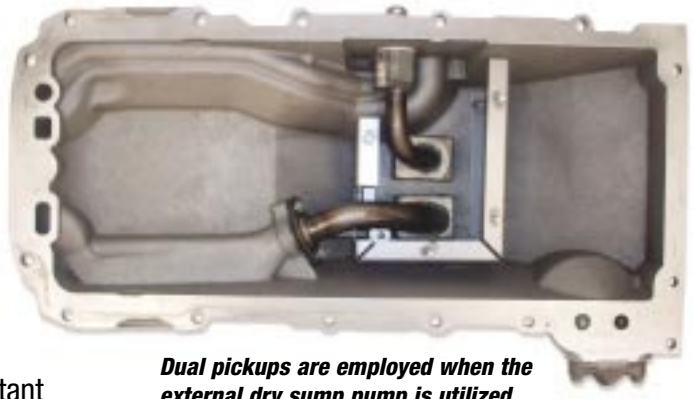
external dry sump pump is utilized