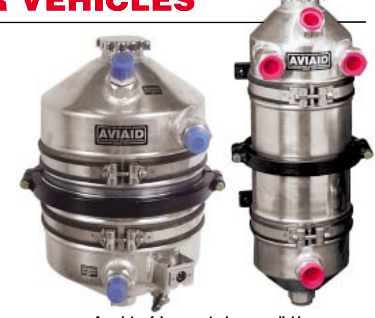
A variety of dry sump tanks are available for other applications. For C5 Vettes a trunk-mounted tank works great.

While a factory Z06 tank (which mounts where the battery is located on ordinary C6 Vettes) can certainly be used here, one of Aviaid's custom dry sump tanks is a better solution. Aviaid offers several different-sized tanks that can be mounted in the trunk, engine compartment, or wherever the builder sees fit.