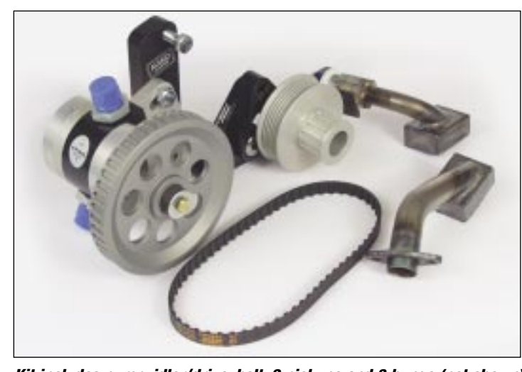
Kit includes pump, idler/drive, belt, 2 pickups and 3 bungs (not shown).

Other than drilling a hole into the pan for the pickup bung, drilling 3 holes and welding 3 fittings in the tank, and running a line to the sump tank, no additional fabrication is required. And the most important thing to remember is that everything has been designed to work in concert with the OEM air conditioner, power steering, alternator, etc. What's more, it does not require relocating the oil filter, or replacing/modifying any oil tank or oil cooler lines. It's as straightforward and clean an installation as you'll find anywhere.