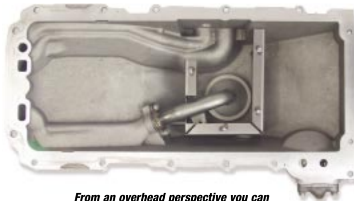
From an overhead perspective you can see how the insert "cage" traps the oil around the factory pickup.