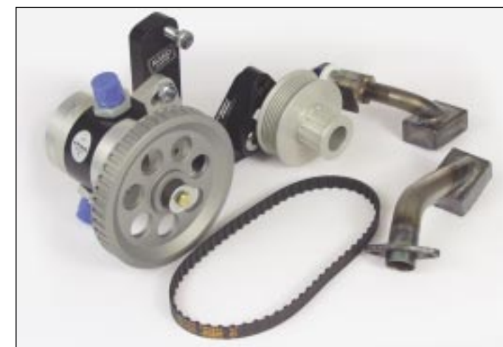
Kit includes pump, idler/drive, belt, 2 pickups and 3 bungs (not shown).

The pump attaches to the passenger side cylinder head and is driven by a timing belt. An adjustable Katech idler assembly featuring a custom combination drive pulley replaces the stock spring-loaded idler and pulley assembly. It is driven by the factory serpentine belt and subsequently drives the pump. The kit includes an auxiliary pickup for scavenging, while a companion pickup replaces the OEM unit. To feed the pump a -10 line is routed from the oil pan to the pump. A tank bung kit that provides connection points for the auxiliary scavenge pump return, an additional vent/breather connection, and a breather tank return are also included.