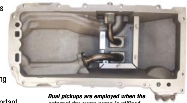
Dual pickups are employed when the external dry sump pump is utilized

Other than drilling a hole into the pan for the pickup bung, drilling 3 holes and welding 3 fittings in the tank, and running a line to the sump tank, no additional fabrication is required. And the most important thing to remember is that everything has been designed to work in concert with the OEM air conditioner, power steering, alternator, etc. What's more, it does not require relocating the oil filter, or replacing/modifying any oil tank or oil cooler lines. It's as straightforward and clean an installation as you'll find anywhere.