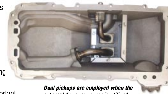
Dual pickups are employed when the external dry sump pump is utilized