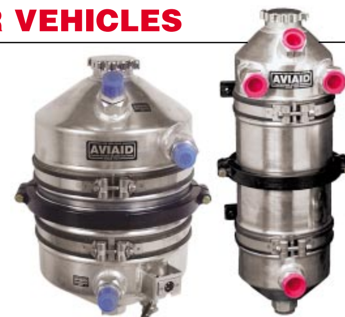
A variety of dry sump tanks are available for other applications. For C5 Vettes a trunk-mounted tank works great.

While a factory Z06 tank (which mounts where the battery is located on ordinary C6 Vettes) can certainly be used here, one of Aviaid's custom dry sump tanks is a better solution. Aviaid offers several different-sized tanks that can be mounted in the trunk, engine compartment, or wherever the builder sees fit.