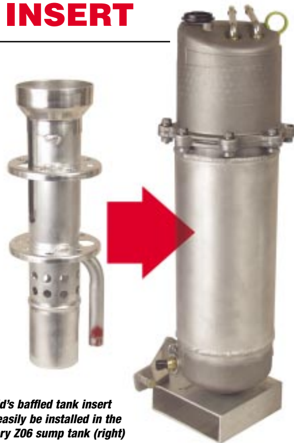
Aviaid's baffled tank insert can easily be installed in the factory Z06 sump tank (right)

The insert is easily installed, requiring only hand tools and a marking device.