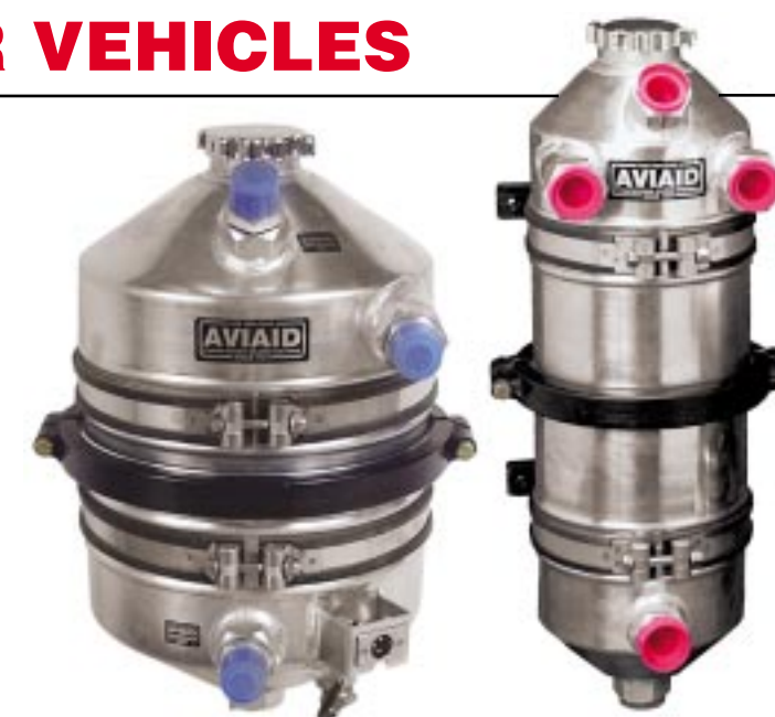
A variety of dry sump tanks are available for other applications. For C5 Vettes a trunk-mounted tank works great.

While a factory Z06 tank (which mounts where the battery is located on ordinary C6 Vettes) can certainly be used here, one of Aviaid's custom dry sump tanks is a better solution. Aviaid offers several different-sized tanks that can be mounted in the trunk, engine compartment, or wherever the builder sees fit.